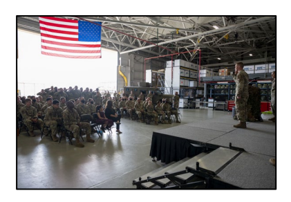
Note: All Data on this card is as of 30 Sep 24 for Fiscal Year 2024 (01 Oct 23 to 30 Sep 24) unless otherwise noted.